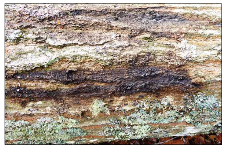
Figure 1.—Cankered region on northern red oak caused by Diplodia corticola infection.