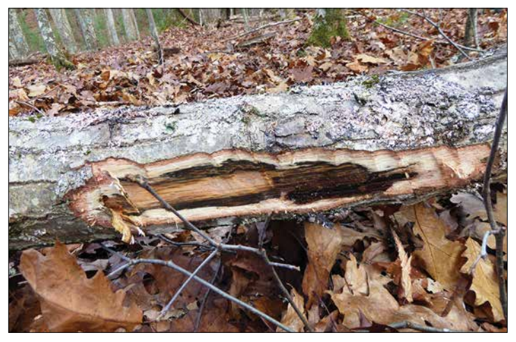
Figure 2.—Cankered region on black oak caused by Diplodia corticola infection.