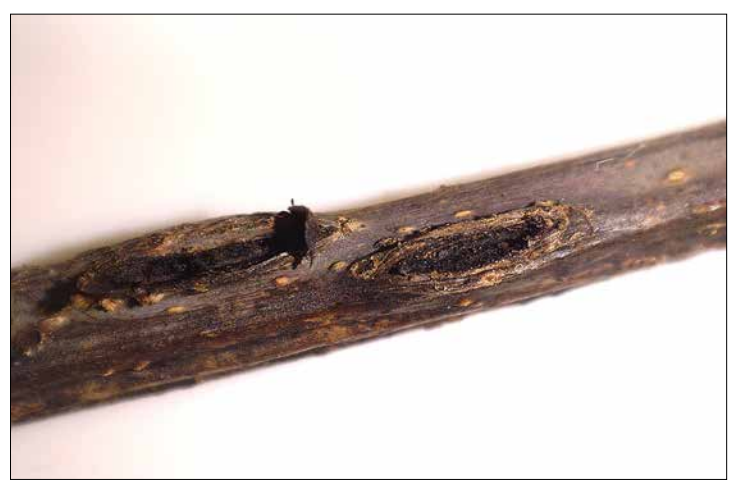
Figure 3.—Cankers on a northern red oak branch caused by Diplodia corticola infection.

and avoid transporting infected wood material long distances. Fungicide treatments have been effective in reducing incidence of cankers on Q. suber in Europe. Fungicide tests in the U.S. are underway to determine the effectiveness and expand fungicide labels.