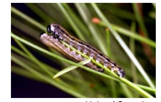
Univ. of Georgia