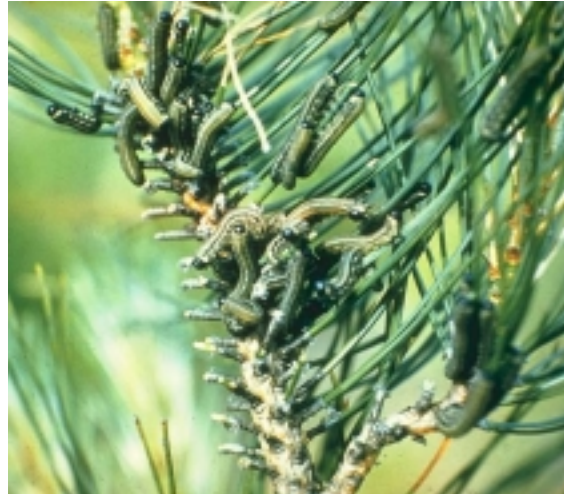
Virginia Tech Univ.